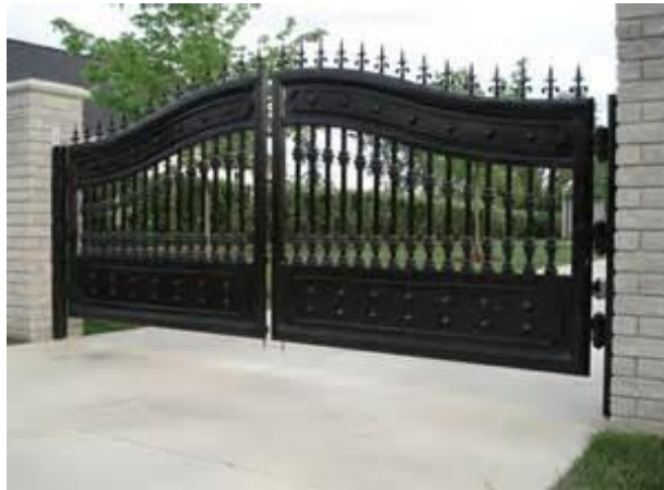
SWING GATES OR BUTTERFLY